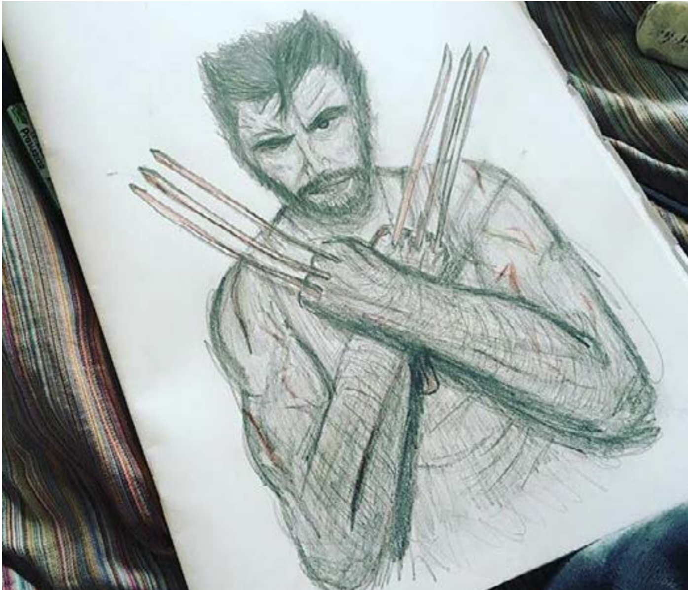
WOLVERINE (HUGH JACKMAN):

Sketched in pencil then shaded with a combination of pencil, charcoal and red pencil